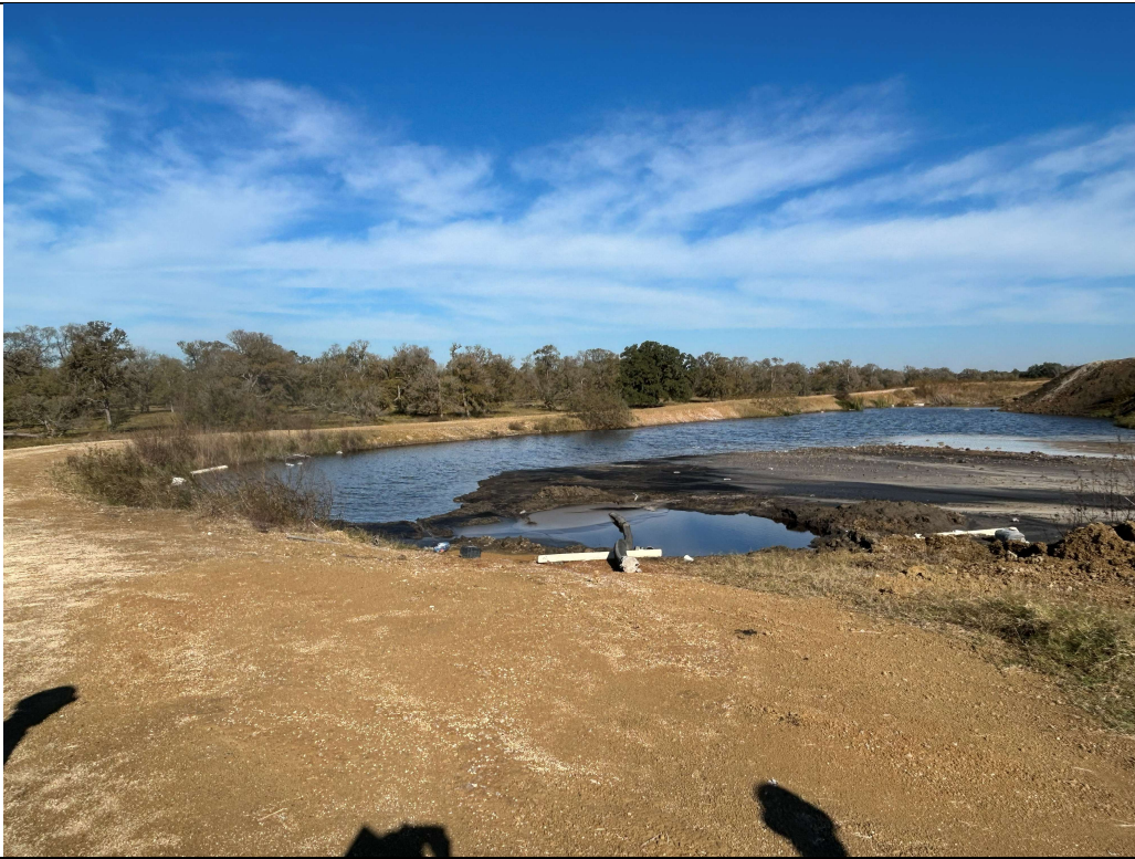
Photograph P-9: View looking northwest across contact water/stormwater pond in Cell 1C.