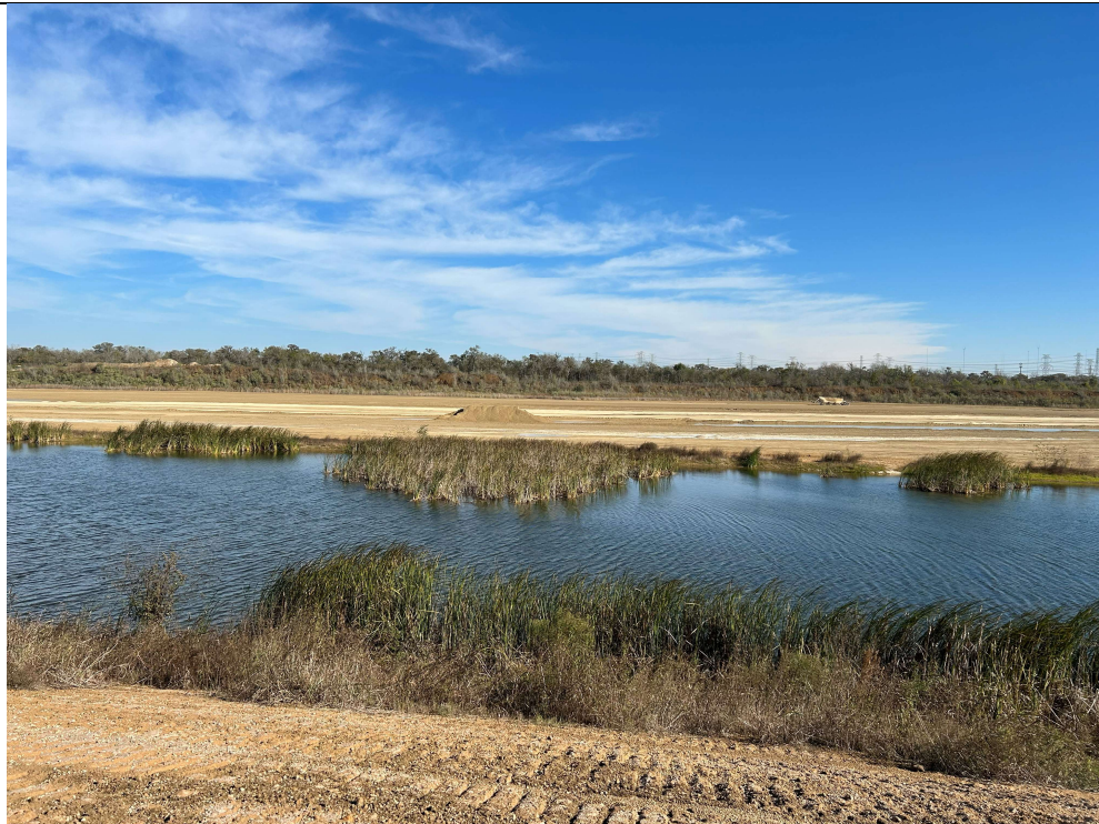
Photograph P-14: View looking north across stormwater pond from Cell 2B's southern berm. The vegetation in the pond is controlled on an as needed basis. Stockpiled fly ash is visible to the north of the pond. Stockpiled scrubber sludge is visible beyond the fly ash (center background).