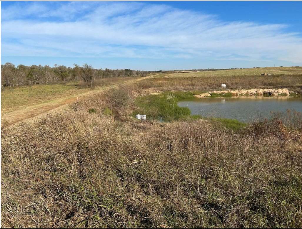
Photograph P-7: View looking north across the Cell 2A stormwater pond. Pond berms are either stabilized or well vegetated.