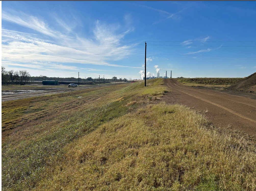
Photograph P-6: View looking south from the western berm of Cell 2A. Exterior berm slopes were well vegetated.