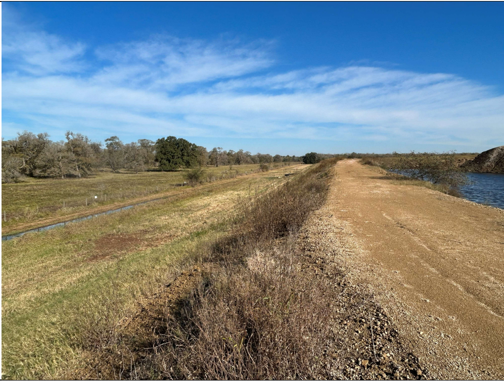
Photograph P-11: View looking north of the landfill berm. The berm road did not have rutting, but the water level in the Cell 1C stormwater pond was higher than normal.