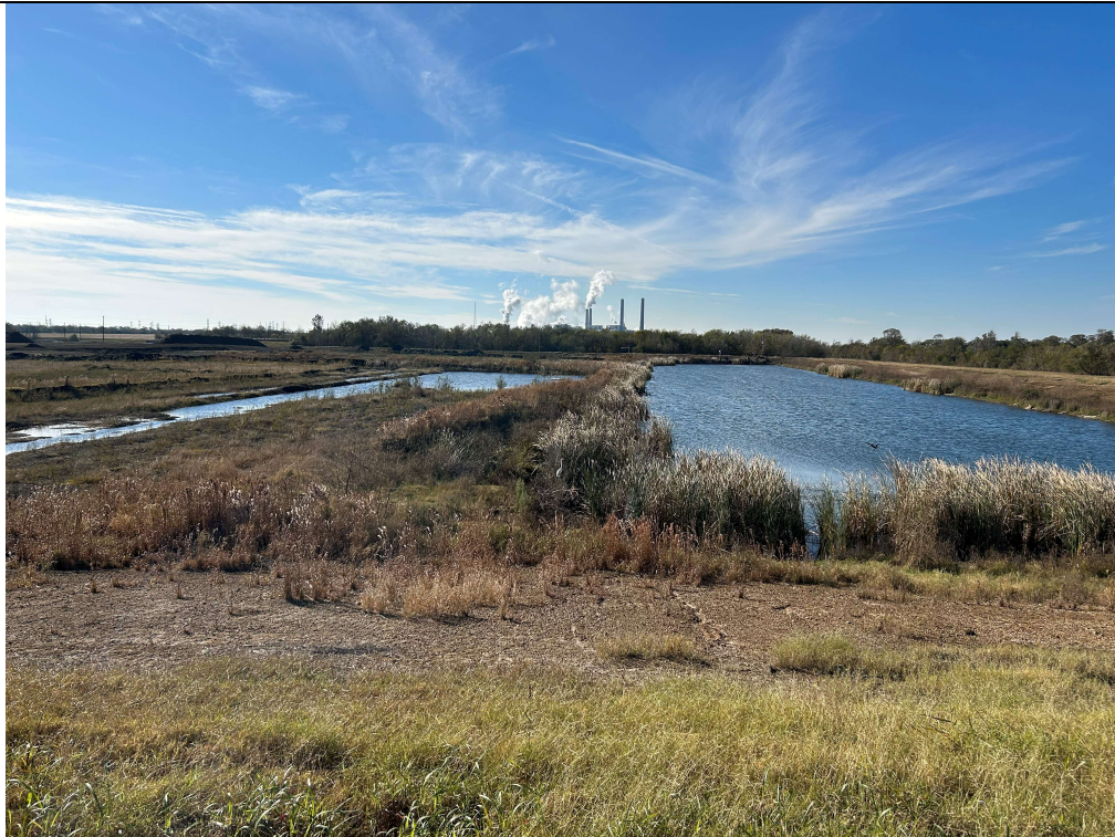
Photograph P-4: View looking south of Cell 3. The water body to the left (east) was created by the excavation and sale of bottom ash in 2025.