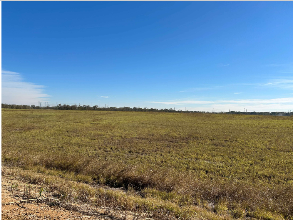
Photograph P-12: View looking east of the portion of Cell 1C that was closed in 2022. The surface of the cover system is well vegetated. No erosional issues were observed.