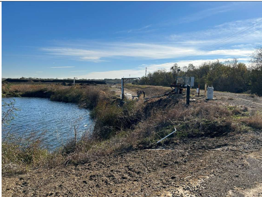
Photograph P-2: View looking east from Cell 3's southwest interior corner. The crest road was well maintained, exterior slopes well vegetated without erosion issues, and interior slope either improved with stabilized CCR material or vegetated.