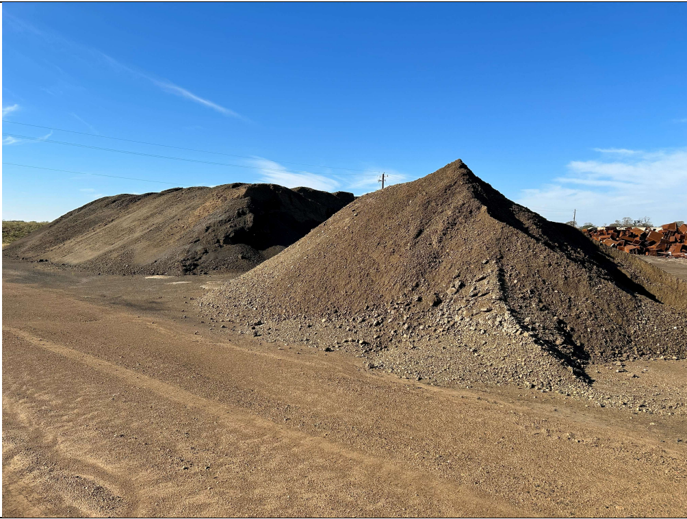
Photograph P-5: View looking southwest at material piles inside Cell 2A.