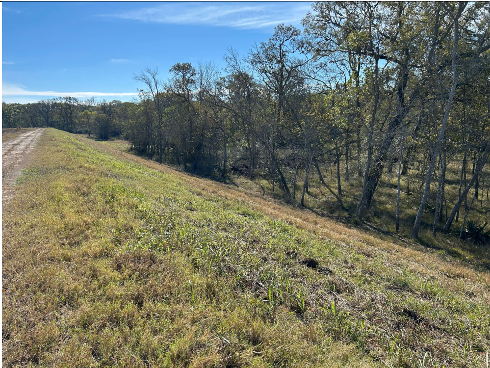
Photograph P-16: View looking southeast of the exterior slope of Cell 2B's southern berm. The exterior slope is well vegetated, stable, and not excessively steep. No erosional issues were observed.