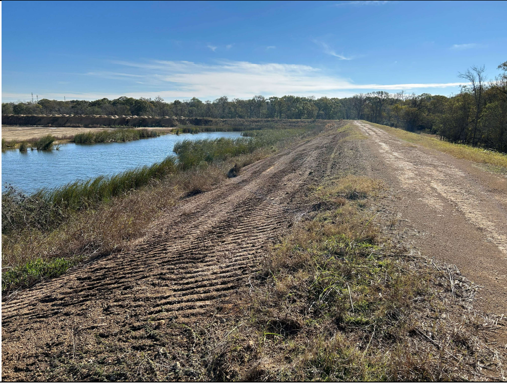
Photograph P-13: View looking northeast across stormwater pond from Cell 2B's southern berm. A repaired portion of the interior berm where a minor slough had occurred is visible in the center of the photograph. Stockpiled scrubber sludge waste is visible beyond the pond inside the landfill (left background).