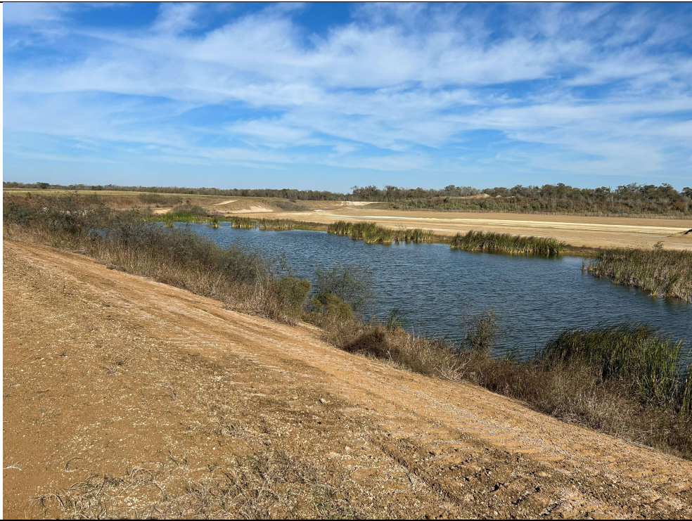
Photograph P-15: View looking northwest across stormwater pond from Cell 2B's southern berm. The vegetation in the pond is controlled on an as needed basis.