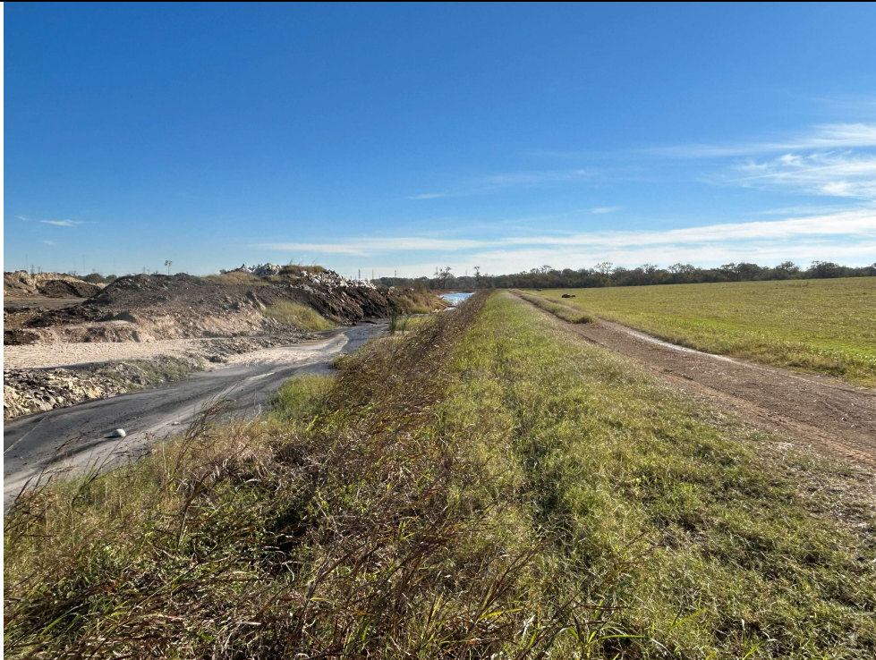
Photograph P-10: View looking east along the southern berm of Cell 1C. An open portion of Cell 1C is visible on the left side of the photograph.