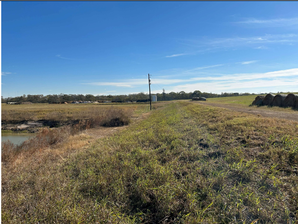
Photograph P-8: View looking east from the berm at the southwest corner of the Cell 2A stormwater pond. Pond berms are either stabilized or well vegetated.