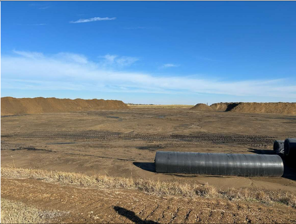
Photograph P-3: View looking northeast of the Cell 3 landfill and Cell 3 Coal Combustion Residual (CCR) waste piles. This material is being sold as road base.