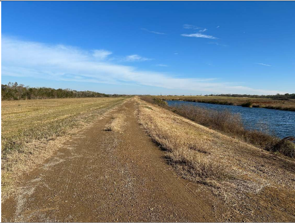
Photograph P-1: View looking north at Cell 3 from top of its west berm. The Cell 3 storm water pond is visible to the right. The interior slopes and crest roads of the berms are either vegetated (slopes) or have been stabilized with a cemented fly ash mixture.