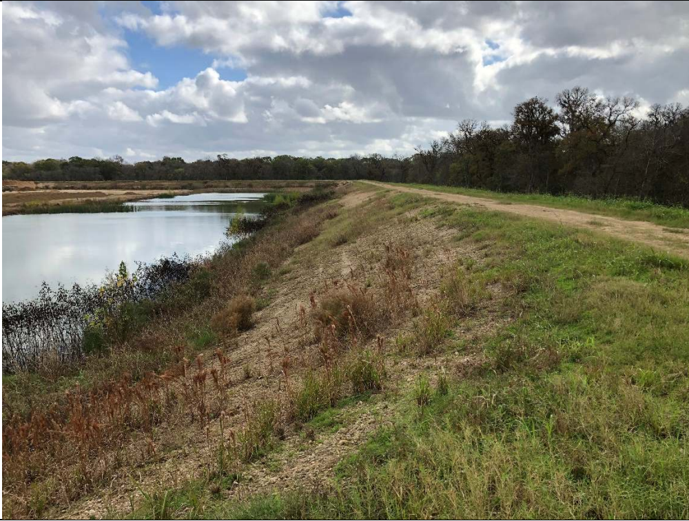
Photograph P-13: View looking southeast of Cell 2B's southern berm from southwest corner of landfill. The Cell 2B stormwater pond is visible to the left.