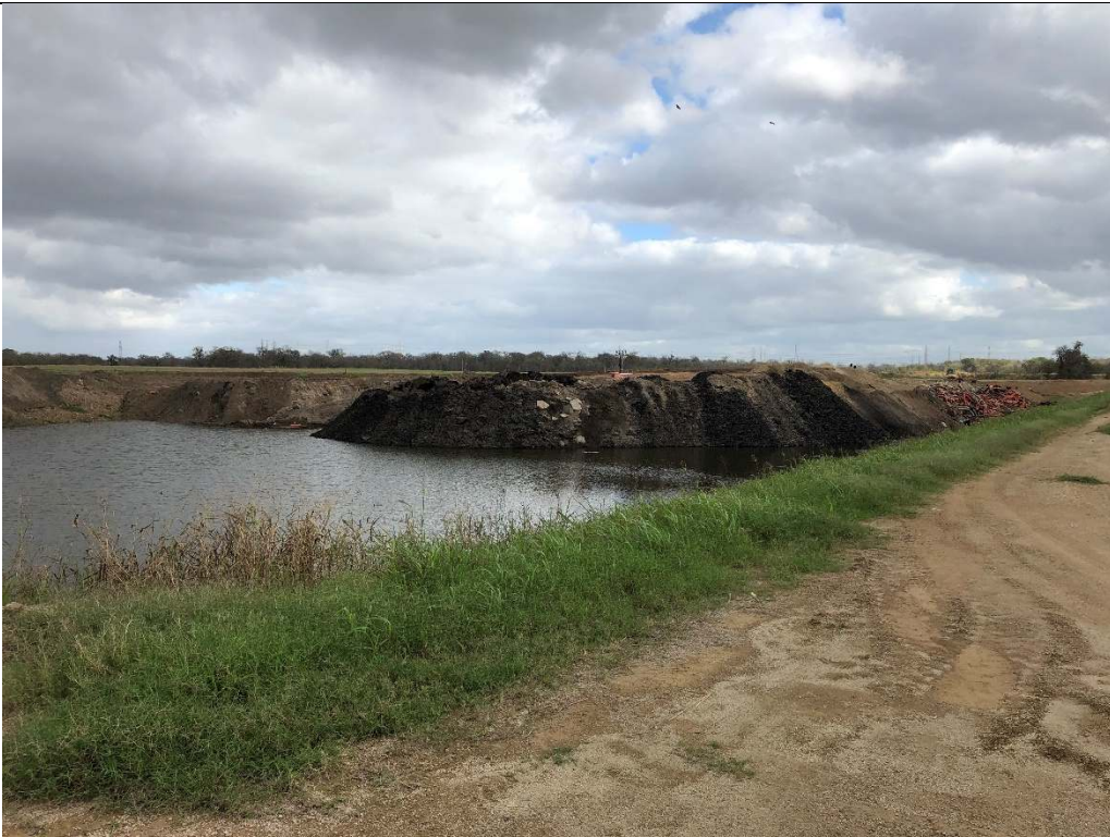
Photograph P-8: View looking northeast from the berm at the southwest corner of Cell 1C. The Cell 1C storm water pond is visible on the left side of this photograph, while waste piles are visible in the background.