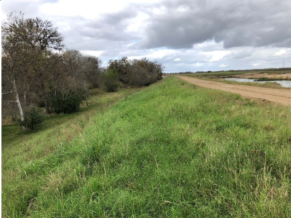
Photograph P-14: View looking northwest of the exterior slope of Cell 2B's southern berm. The exterior slope is well vegetated.