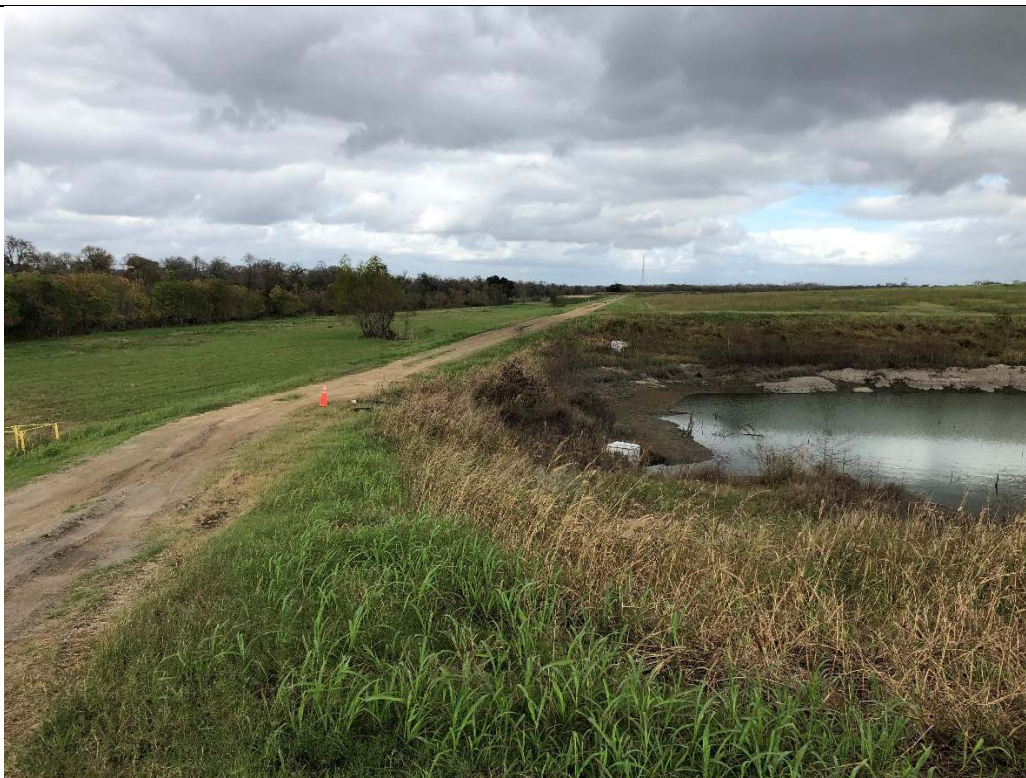
Photograph P-6: View looking north across the contact water pond in Cell 2A. Slopes were either stabilized or well vegetated.