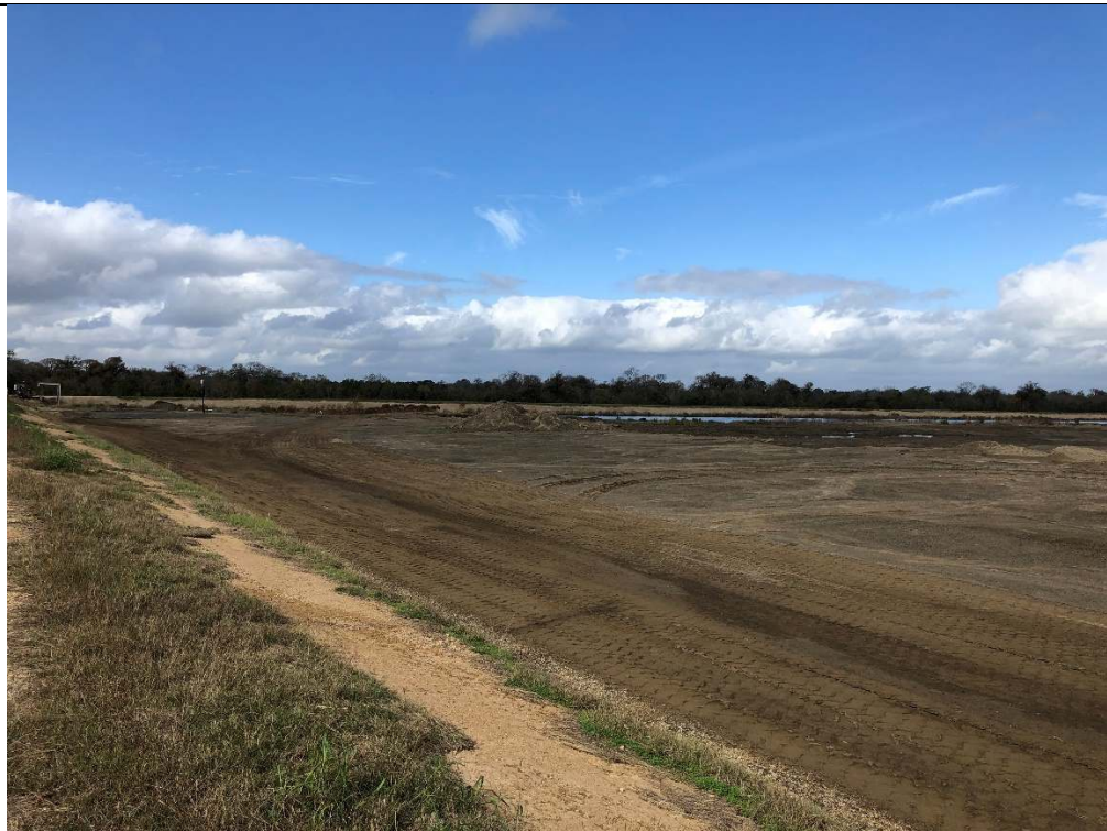
Photograph P-2: View looking west-northwest from Cell 3's south berm. The crest road was well maintained, exterior slopes well vegetated without erosion issues, and interior slope either improved with stabilized CCR material or vegetated.