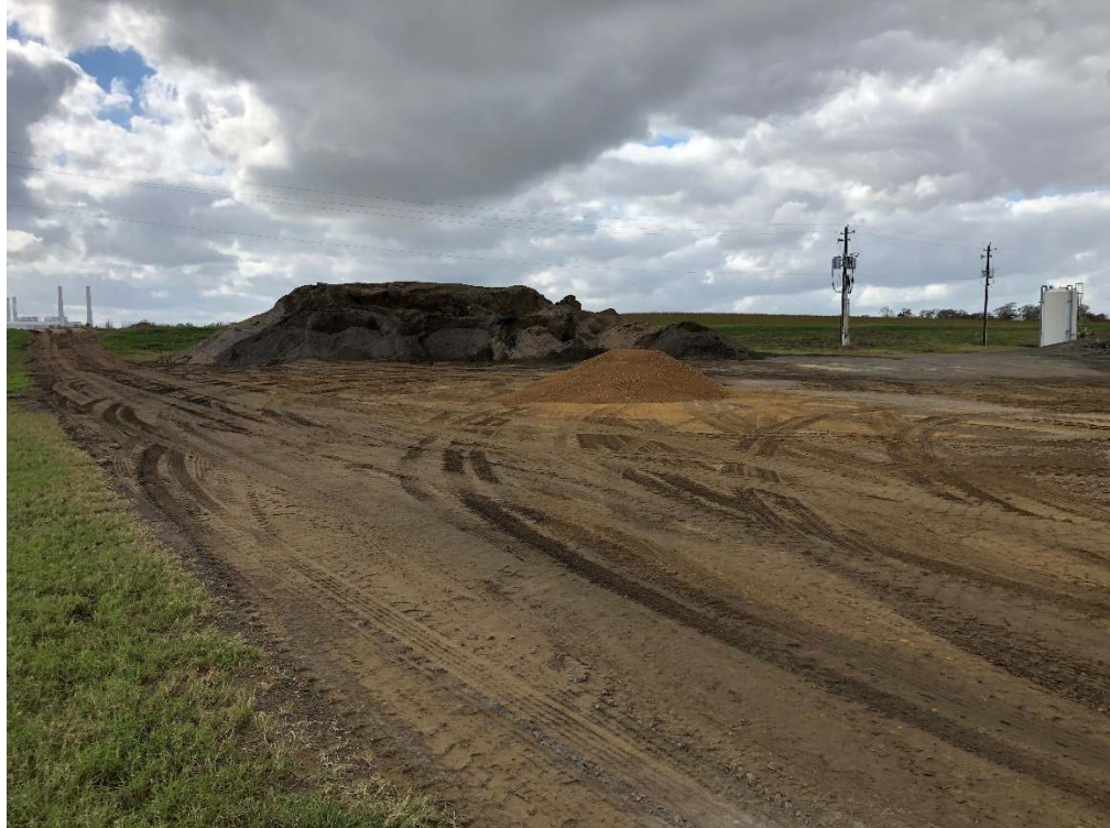
Photograph P-4: View looking southwest along the eastern edge of Cell 2A (the Pugmill Area). Stockpiled, salable CCR material is visible in the background of this photograph.