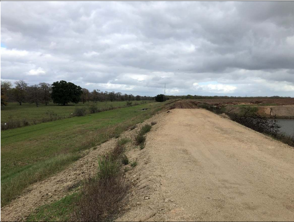
Photograph P-9: View looking north along the western berm of Cell 1C. Picture was taken from berm at southwest corner of Cell 1C. Outside of a recently repaired section (where a stormwater culvert was installed across the road) the crest road was stabilized. No significant rutting was observed.