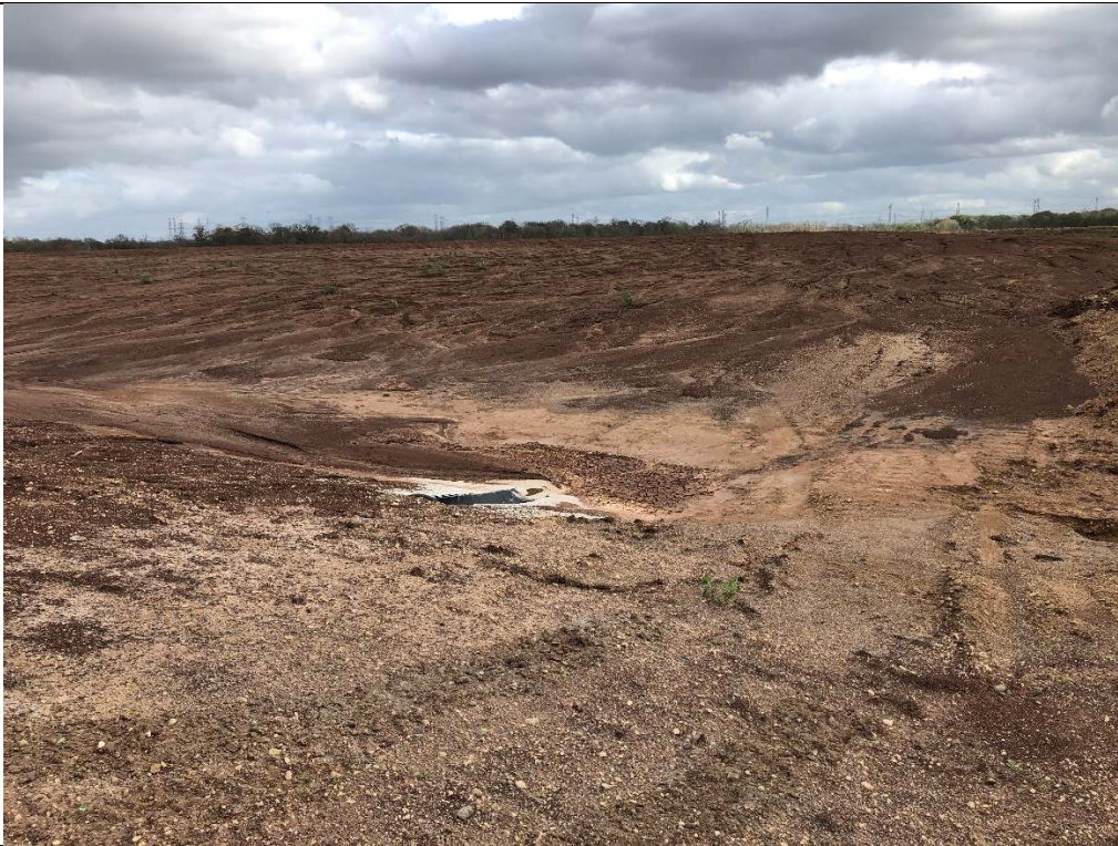
Photograph P-11: View looking east across recently closed portion of Cell 1C. The inlet of a stormwater culvert directing stormwater flow from the top of the recently closed portion of the landfill is visible. This culvert passes under the crest road.