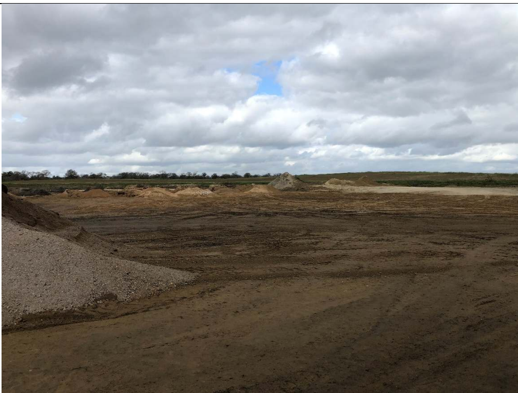
Photograph P-5: View looking northwest from the eastern edge of Cell 2A. Stockpiles of salable CCR material are visible in this photograph.