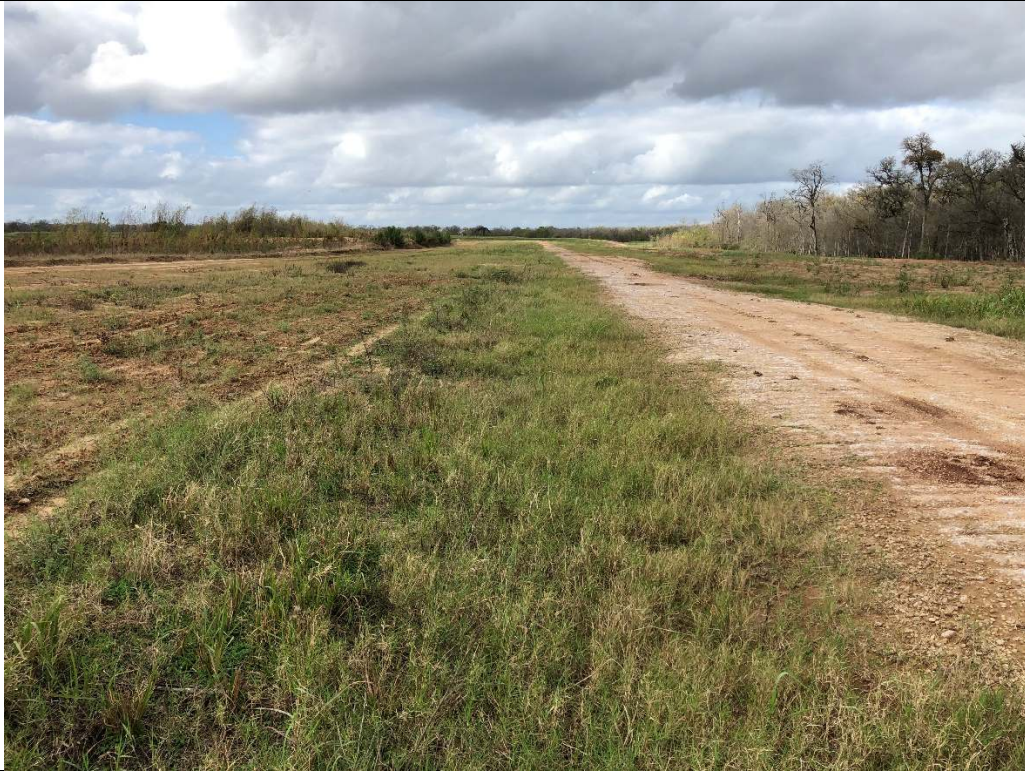
Photograph P-16: View looking west-northwest from northern Cell 2B berm. The crest road is visible to the right, FGD system waste is visible to the left.