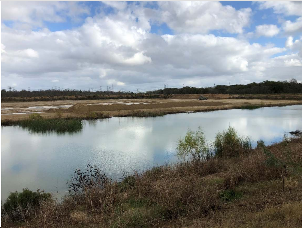
Photograph P-15: View looking northeast from southern berm across storm water pond at waste stored in Cell 2B. Stockpiled fly ash is visible in the center of the photograph, while CCR waste from the Flue Gas Desulfurization (FGD) system is visible beyond the fly ash.