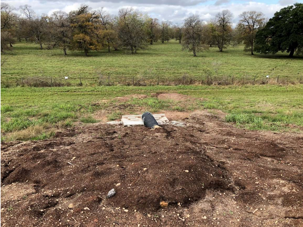
Photograph P-12: View looking west of the new stormwater culvert's outlet structure.