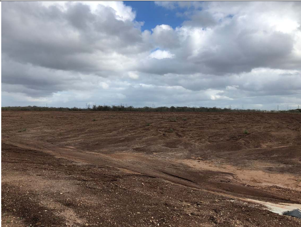
Photograph P-10: View looking east across recently closed portion of Cell 1C. Exposed topsoil (the uppermost layer of the cover system) is visible here.