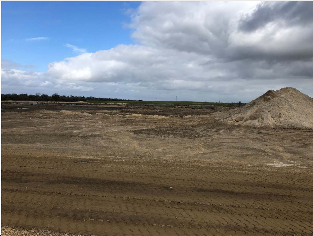
Photograph P-3: View looking north of interior of Cell 3 landfill and Cell 3 Coal Combustion Residual (CCR) waste piles.