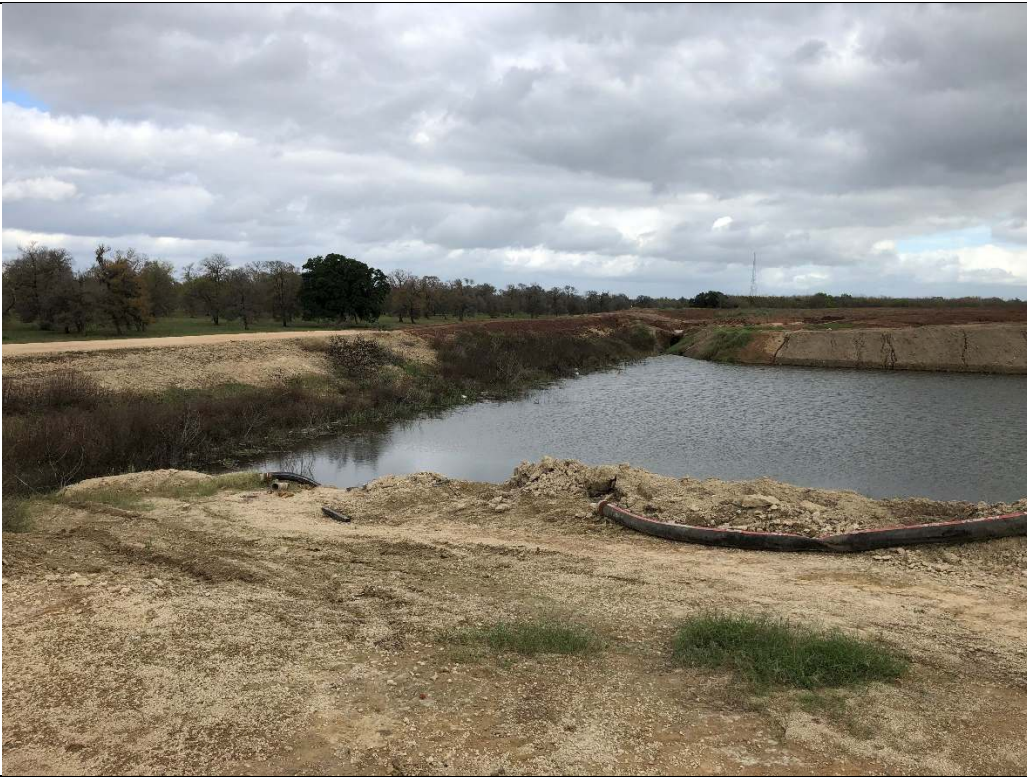
Photograph P-7: View looking north across the contact water pond in Cell 1C. This view is towards the area that was recently closed (located just to the north of the pond). Slopes were well stabilized.