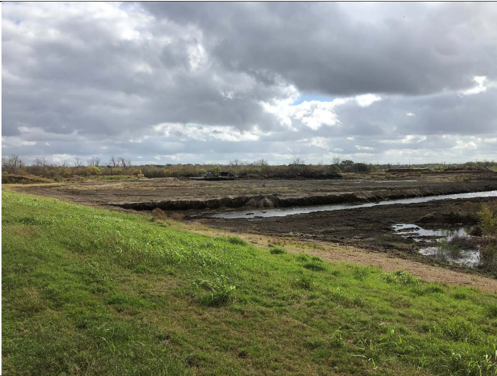
Photograph P-1: View looking southeast of Cell 3 from top of north berm. The darker bottom ash material is visible in this photograph, as is the area where the bottom ash is being excavated from the landfill and sold as road base. The Cell 3 storm water pond is visible to the right. The interior slopes and crest roads of the berms are either vegetated (slopes) or have been stabilized with a cemented fly ash mixture.