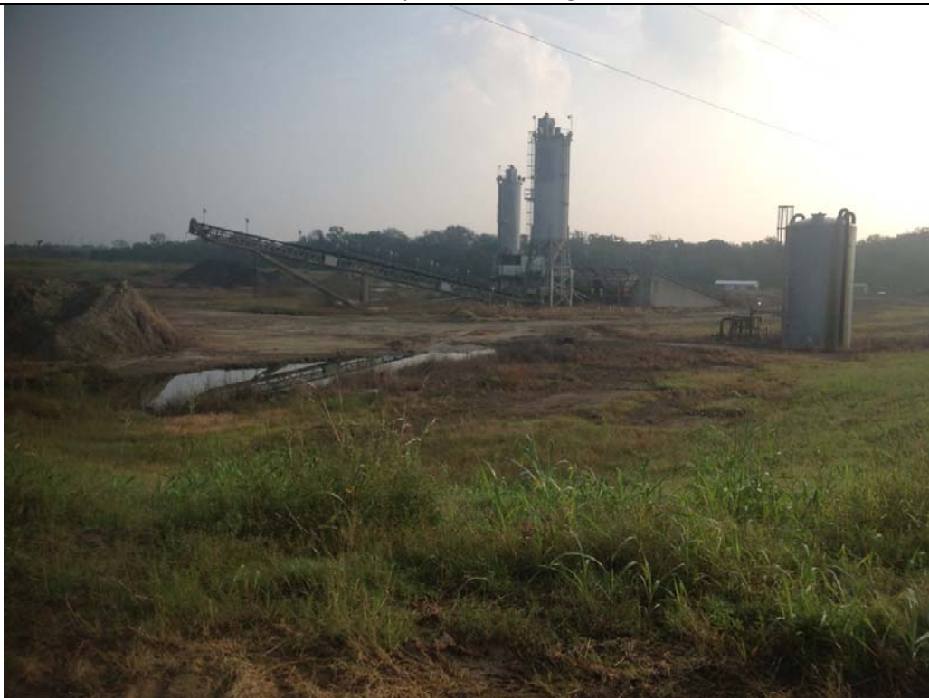
Photograph P-4 Taken November 7, 2018 Landfill Cell 2a Pugmill – Looking northeast into center of landfill Cell 2a Pugmill.