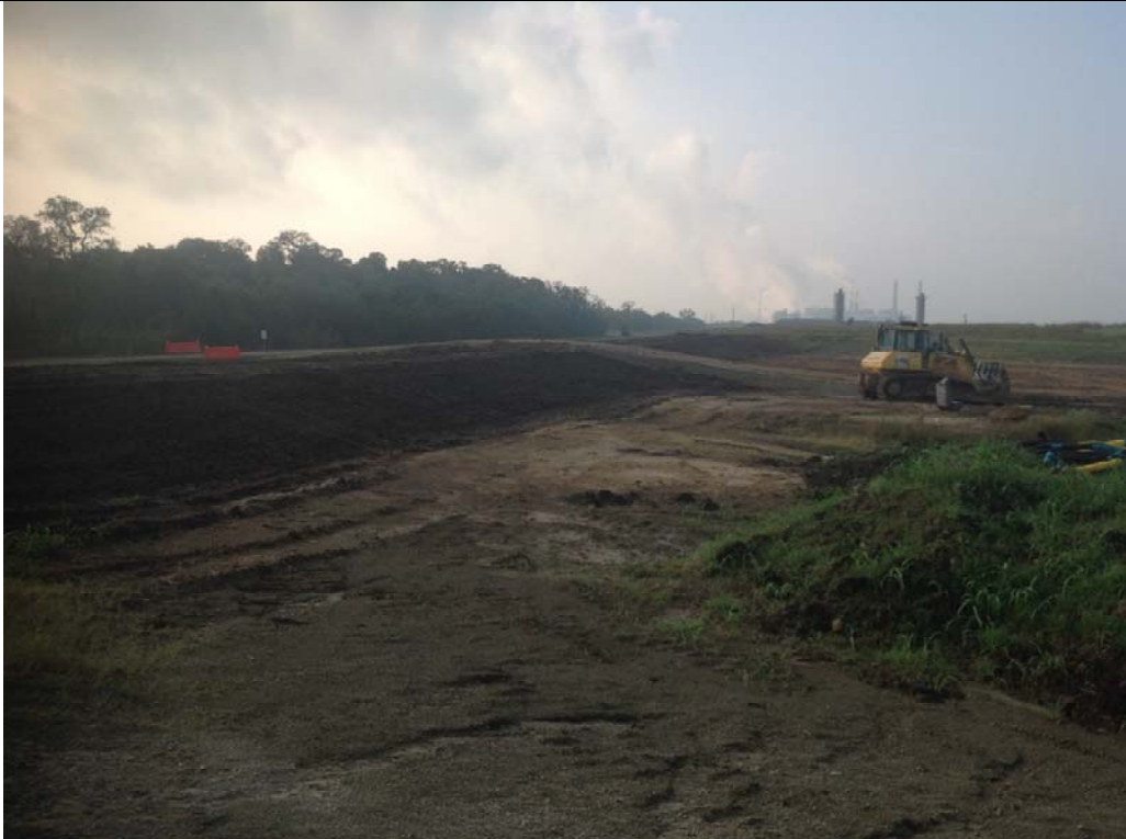
Photograph P-6 Taken November 7, 2018 by Jason Leik, P.E. Landfill Cell 1C – Looking south at inside slope of newly improved eastern berm.