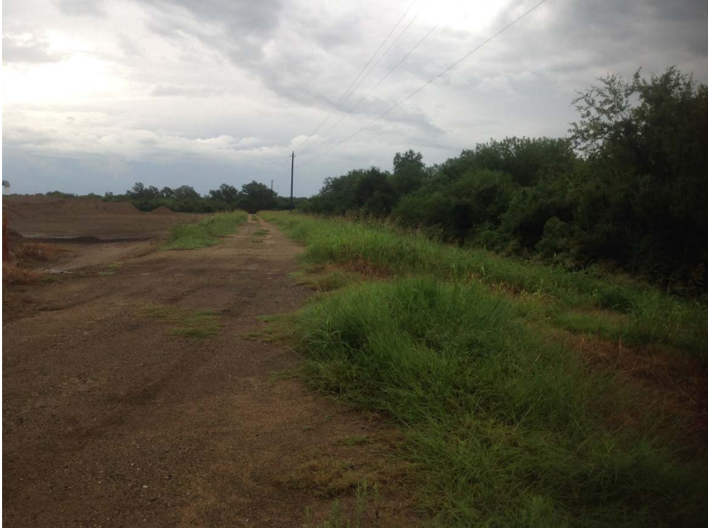
Photograph P-2 Taken September 11, 2018 (During Location Restriction Inspection) Landfill Cell 3 – Looking east along southern berm of landfill Cell 3.