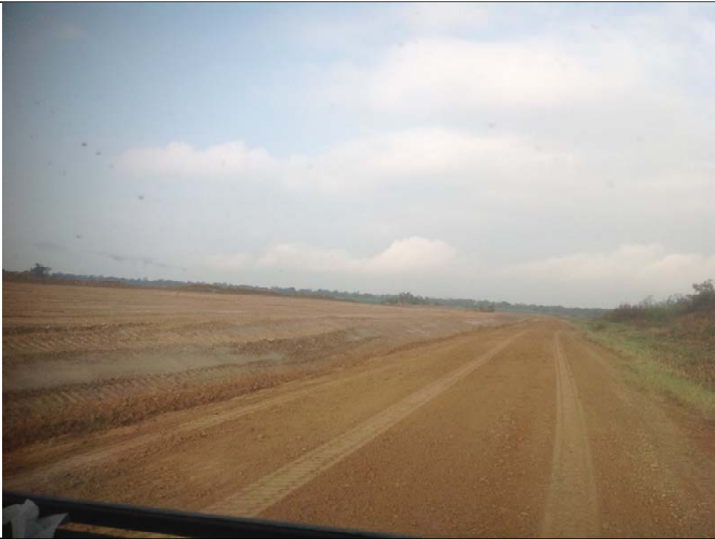
Photograph P-7 Taken November 7, 2018 by Jason Leik, P.E. Landfill Cell 2B – Looking west along crest of north berm. CCR material placed on left.