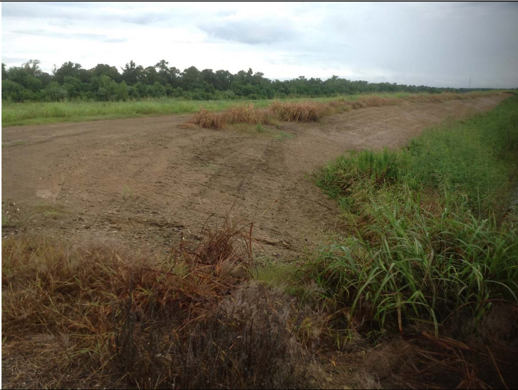
Photograph P-1 Taken September 11, 2018 by Jason Leik, P.E. (During Location Restriction Inspection) Landfill Cell 3 – Looking north along west crest and inside slope of west berm of landfill.