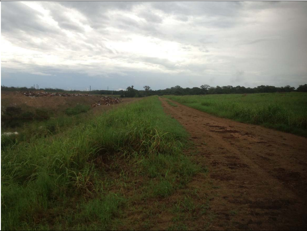
Photograph P-5 Taken September 11, 2018 by Jason Leik, P.E. (During Location Restriction Inspection) Landfill Cell 1C – Looking east along crest and inside slope of south berm of landfill.