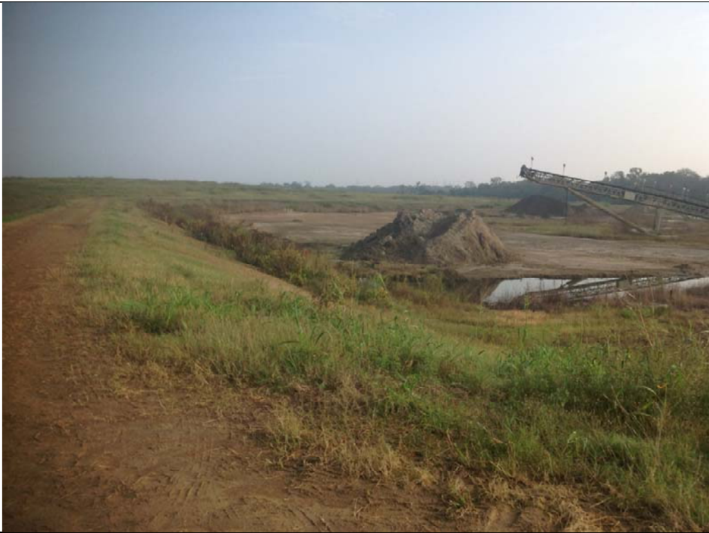
Photograph P-3 Taken November 7, 2018 Landfill Cell 2a Pugmill – Looking north along west crest and inside slope of west berm of landfill. Pugmill loading conveyor visible on right