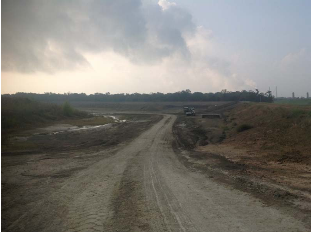
Photograph P-8 Taken November 7, 2018 by Jason Leik, P.E. Landfill Cell 2B – Looking south into interior of Cell 2B from top of north berm. West and south berms visible.