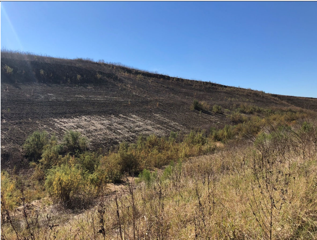
Photograph P-6: View looking across contact water ditch of Area 4 sidewall.