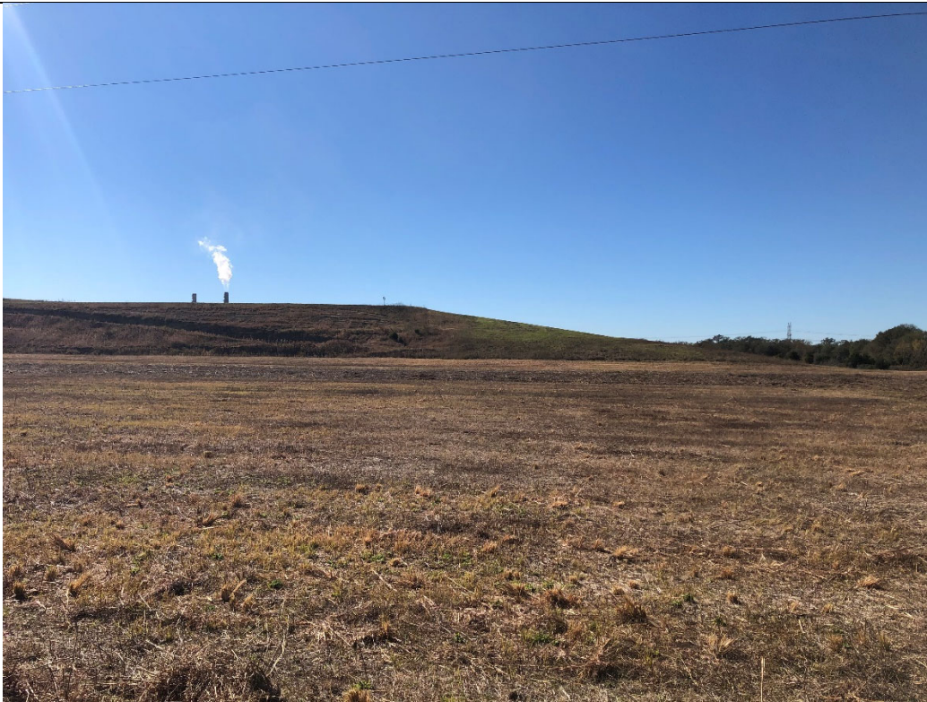
Photograph P-5: View looking southwest across Area 13 (a lined portion of the landfill that will be used in the future) at the sidewall of Area 1.