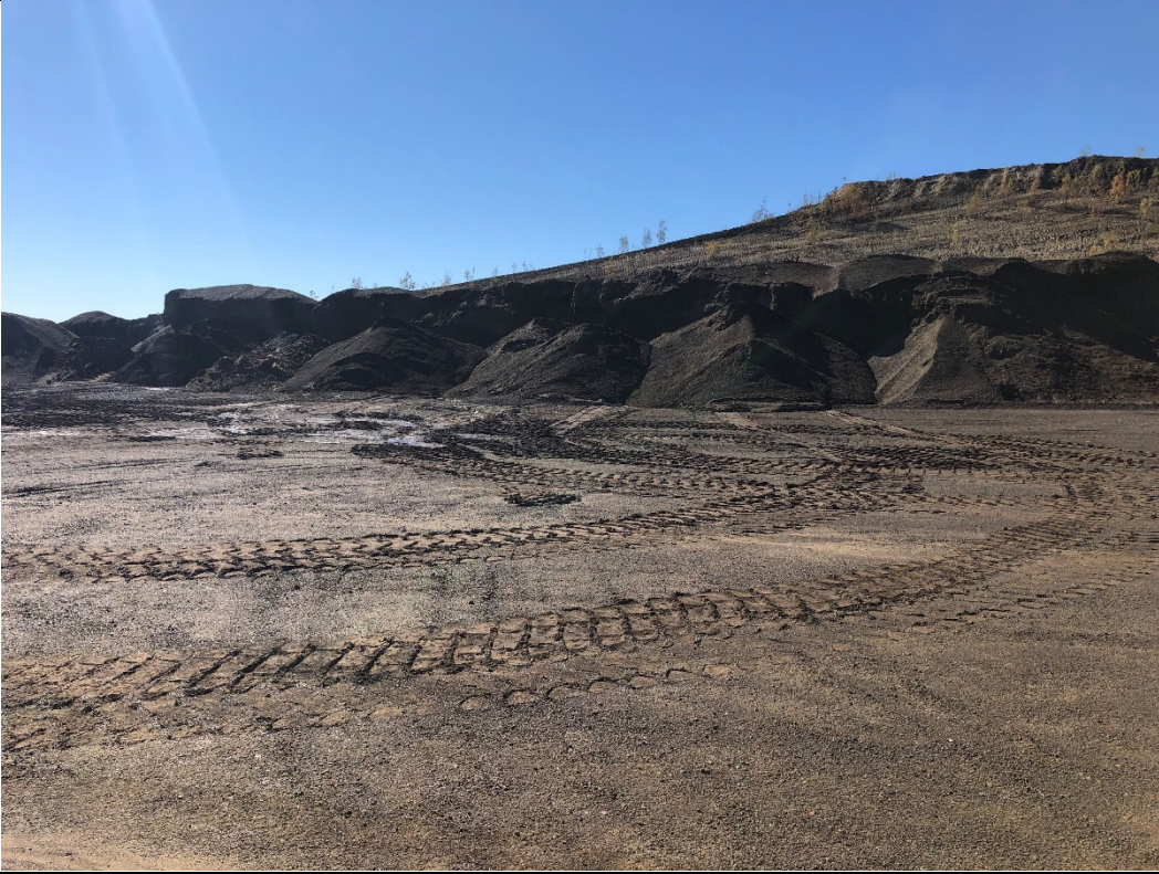
Photograph P-9: Another view of CCR material in Area 12A. An uncapped sidewall of CCR material in Area 11 is visible in the right background.