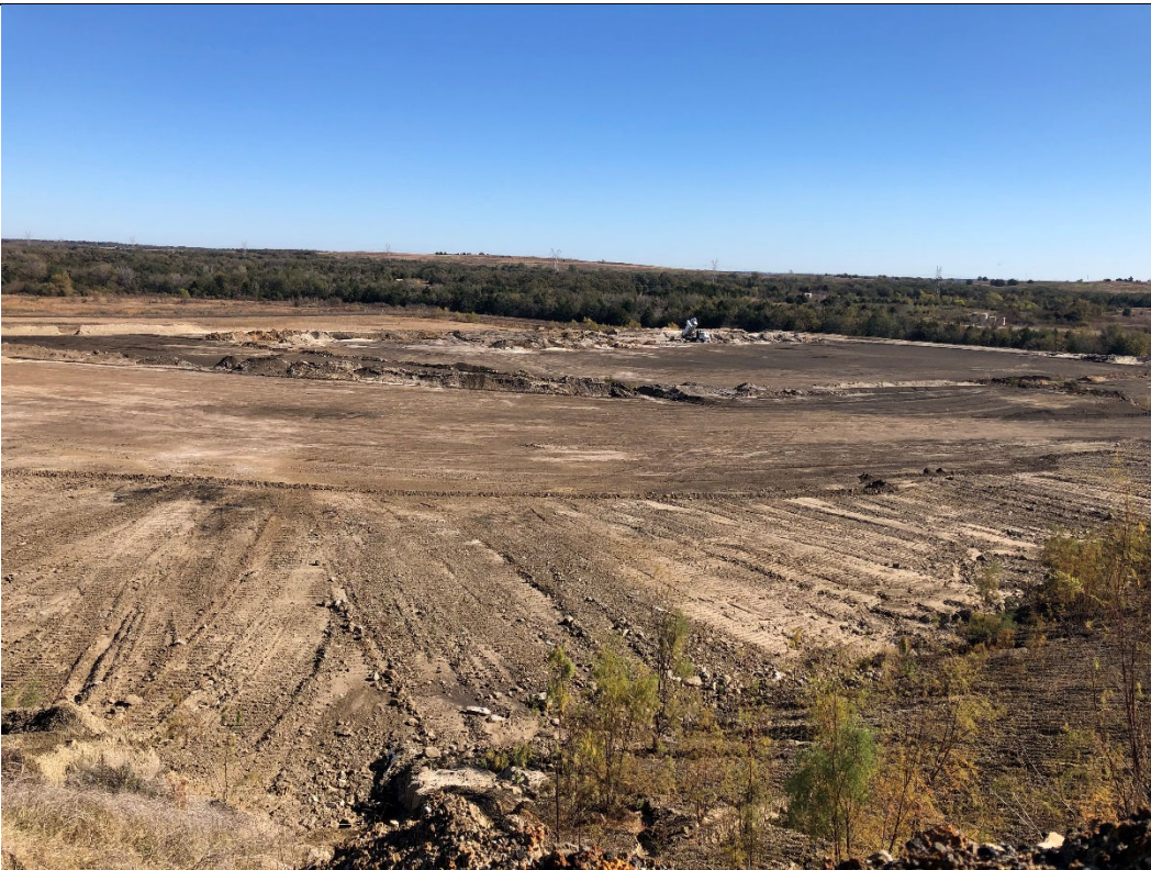
Photograph P-10: Another view of Area 12A as seen from Area 11.