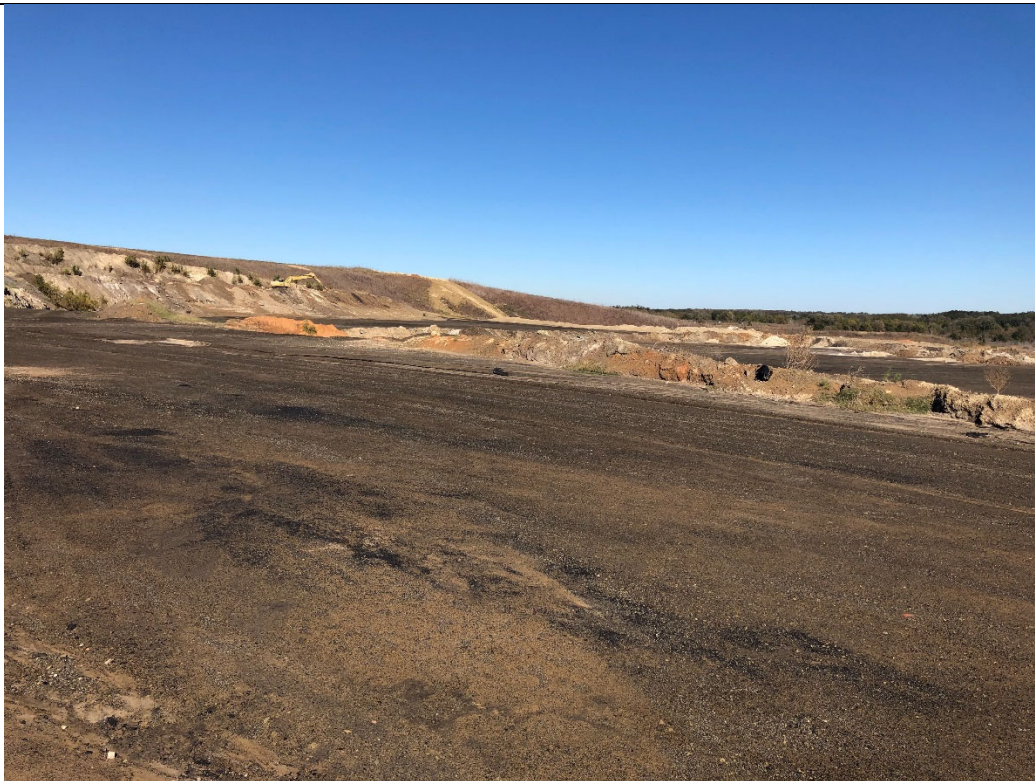
Photograph P-8: View looking north of Area 12A, where CCR is currently being disposed. An uncapped CCR slope in Area 8 is visible in the left background of the photograph.