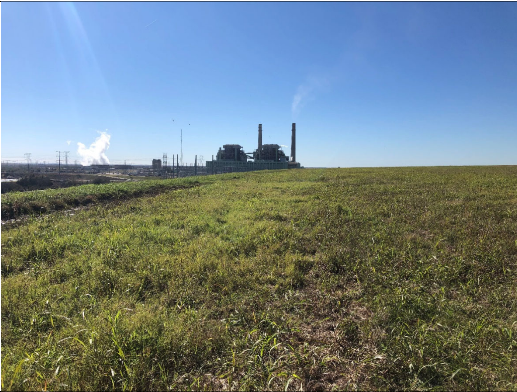
Photograph P-1: View looking southwest across the capped surfaces of Areas 9 and 10. The landfill cap appeared to be well vegetated and appropriately sloped.