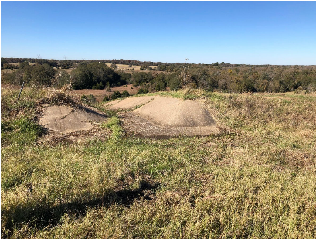
Photograph P-2: View looking west of concrete drainage structure in Area 5 that conveys drainage from the top of the capped portion of the landfill to the non-contact water perimeter ditch.