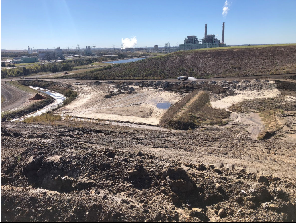
Photograph P-11: View looking west across Area 11. This area was formerly a storage area for marketable CCR, but will be an active disposal area in the landfill in the future. The sidewall of Area 10 is visible in the background.