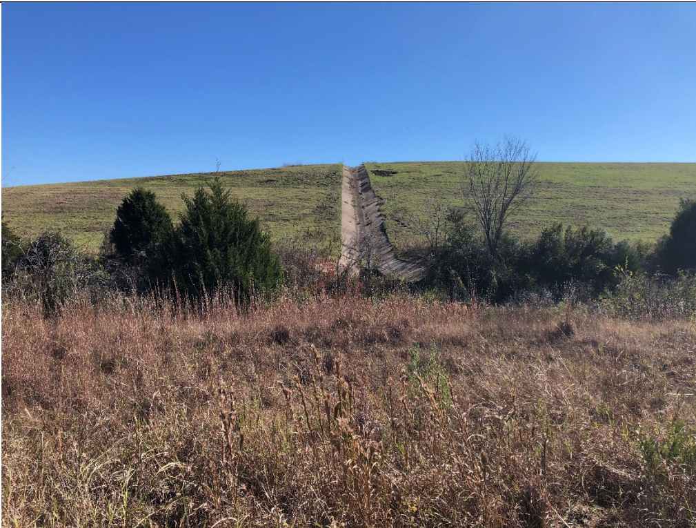
Photograph P-3: View looking southeast at Area 1 of the Unit 004 Landfill. The landfill slopes were well vegetated. The concrete drainage structure conveys runoff from the top of the Unit. It empties into an unseen drainage ditch separated from the viewer by a berm.