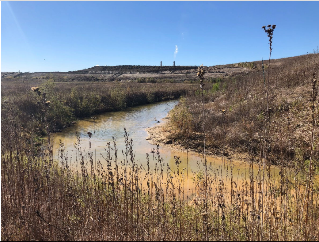
Photograph P-7: View looking west across contact water ditch adjacent to the southeast corner of Area 8. Area 12A (the current active waste disposal area) is visible in the center background.