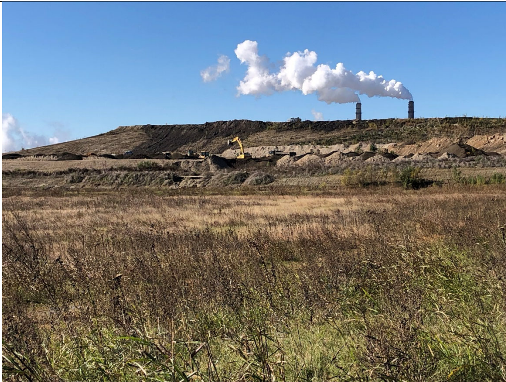
Photograph P-11: View looking west across Area 12C of active landfilling operations in Areas 12A and 12B.