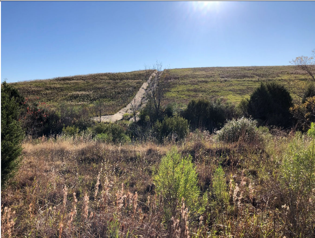
Photograph P-4: View looking southeast at Area 1 of the Unit 004 Landfill. The landfill slopes were well vegetated. The concrete drainage structure conveys runoff from the top of the Unit. It empties into an unseen drainage ditch separated from the viewer by a berm..