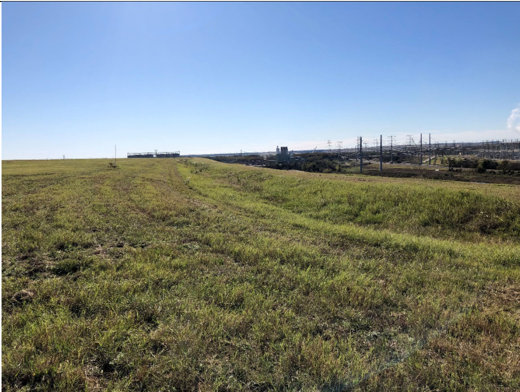
Photograph P-3: View looking south of a stormwater ditch directing drainage from the top of the landfill in Area 5 to the concrete drainage structure shown in Photograph P-3.