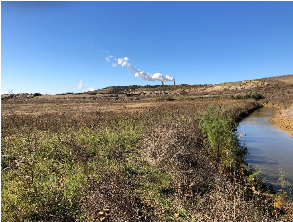
Photograph P-12: View looking west-southwest of contact water ditch (right) and Area 12B (center background). Water visible in the ditch was from a heavy rain that fell prior to the November 30, 2020 site visit.