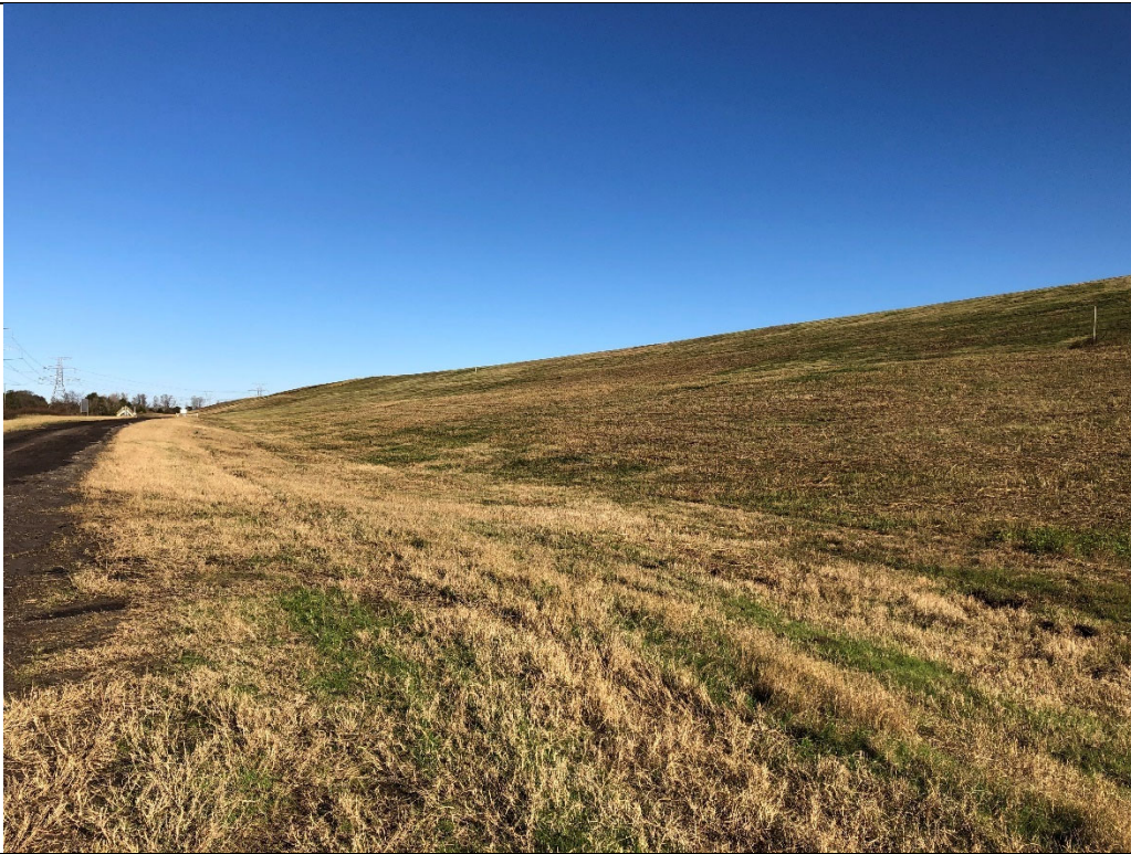
Photograph P-5: View looking northwest of capped southwest sidewall of Area 9. The sidewalls and capped surface of the landfill were well vegetated.