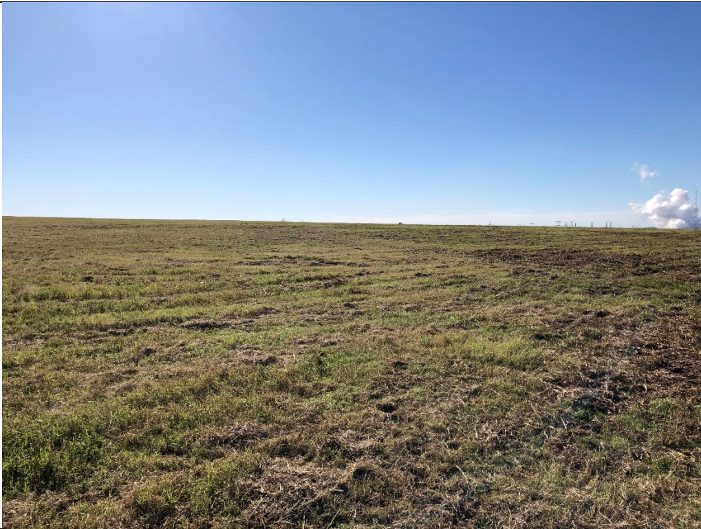
Photograph P-1: View looking west across the capped surfaces of Area 2. The landfill cap appeared to be well vegetated and appropriately sloped.