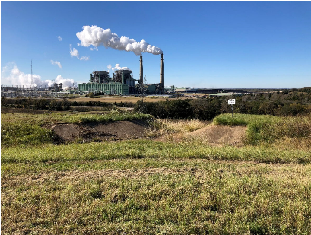
Photograph P-2: View looking west-southwest of Limestone Electric Generating Station from top of Area 5. A concrete drainage structure that conveys drainage from the top of the capped portion of the landfill to the non-contact water perimeter ditch.