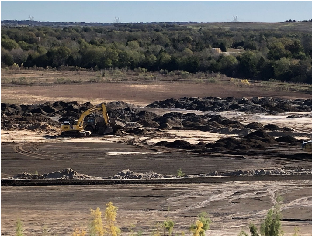
Photograph P-9: View looking east of active landfilling operations in Areas 12A (foreground) and 12B (center background). Area 12C is visible on the far side of area 12B.