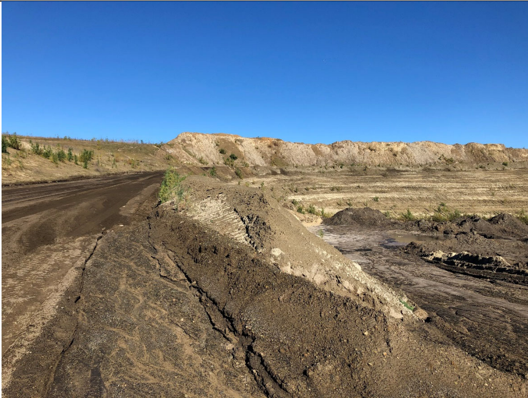
Photograph P-8: View looking north of CCR material. Uncapped CCR slopes in Areas 6 and 10 and the haul road are visible to the left, the marketable CCR material stackout area in Area 11 is visible in the right foreground, and bermed CCR material in Areas 7 and 8 is visible in the center and right background.