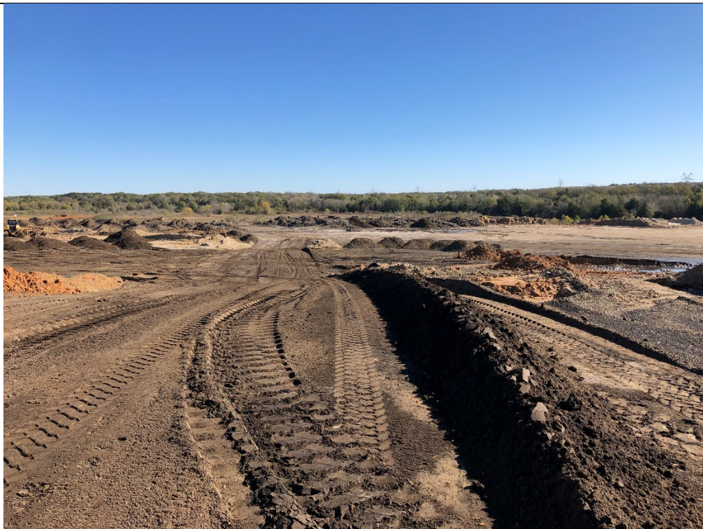
Photograph P-10: View looking east of active landfilling operations in Area 12A.