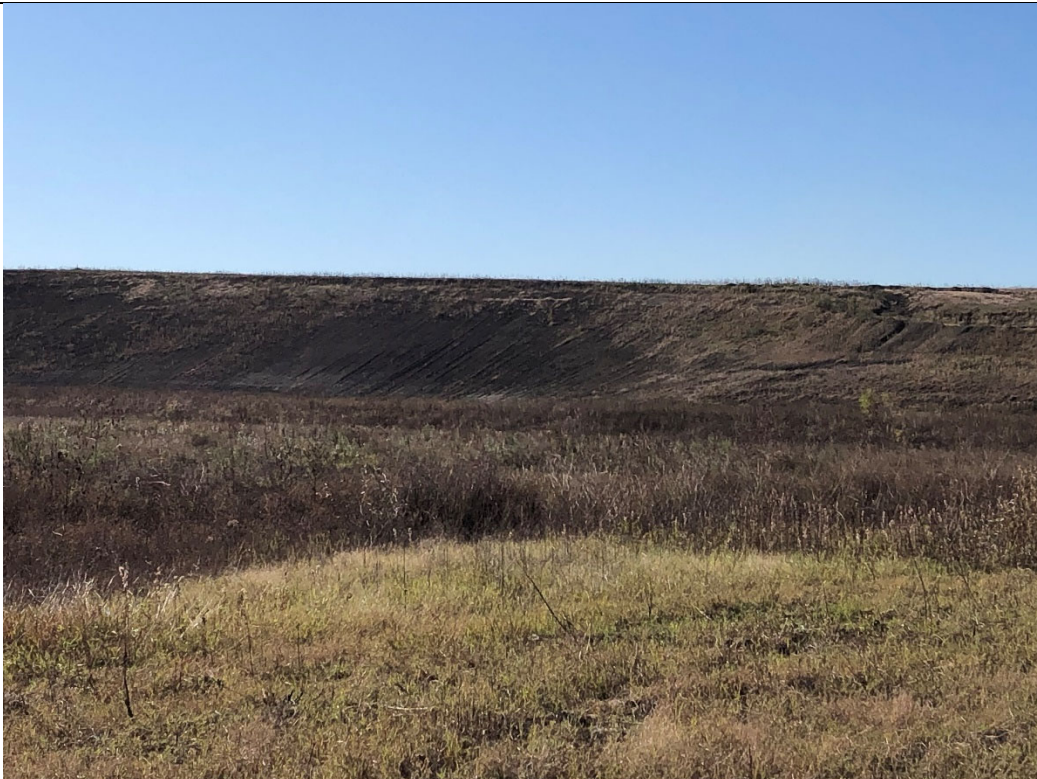
Photograph P-6: View looking south across Area 13 of the uncapped northeast sidewall of Area 1.