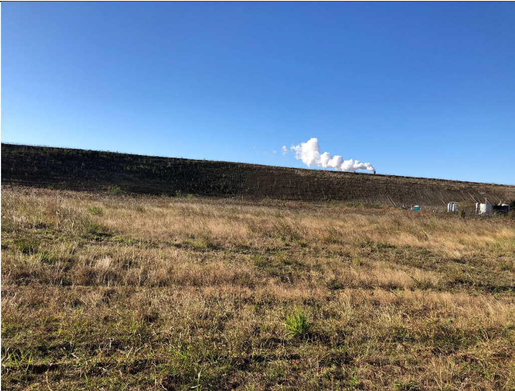
Photograph P-7: View looking southwest across Area 19 of the uncapped northern sidewall of Area 4.